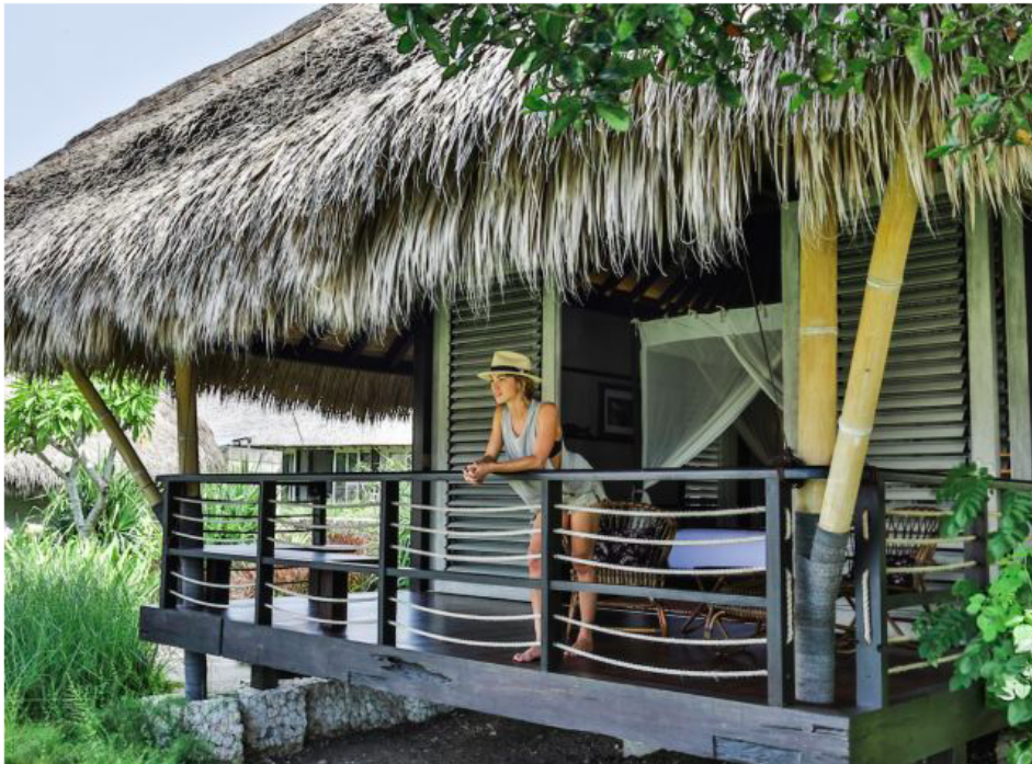
Warm, sensitive and sustainably designed, Suarga Padang Padang is modern luxury